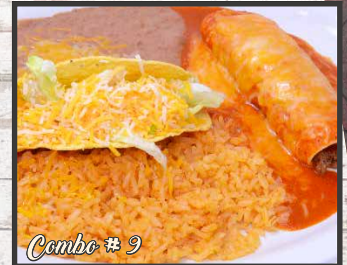
Combo # 9